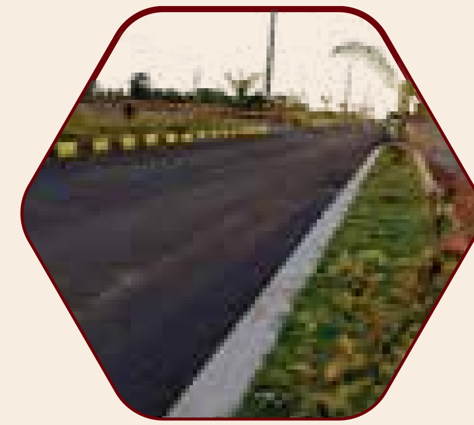
Black Top Internal Roads