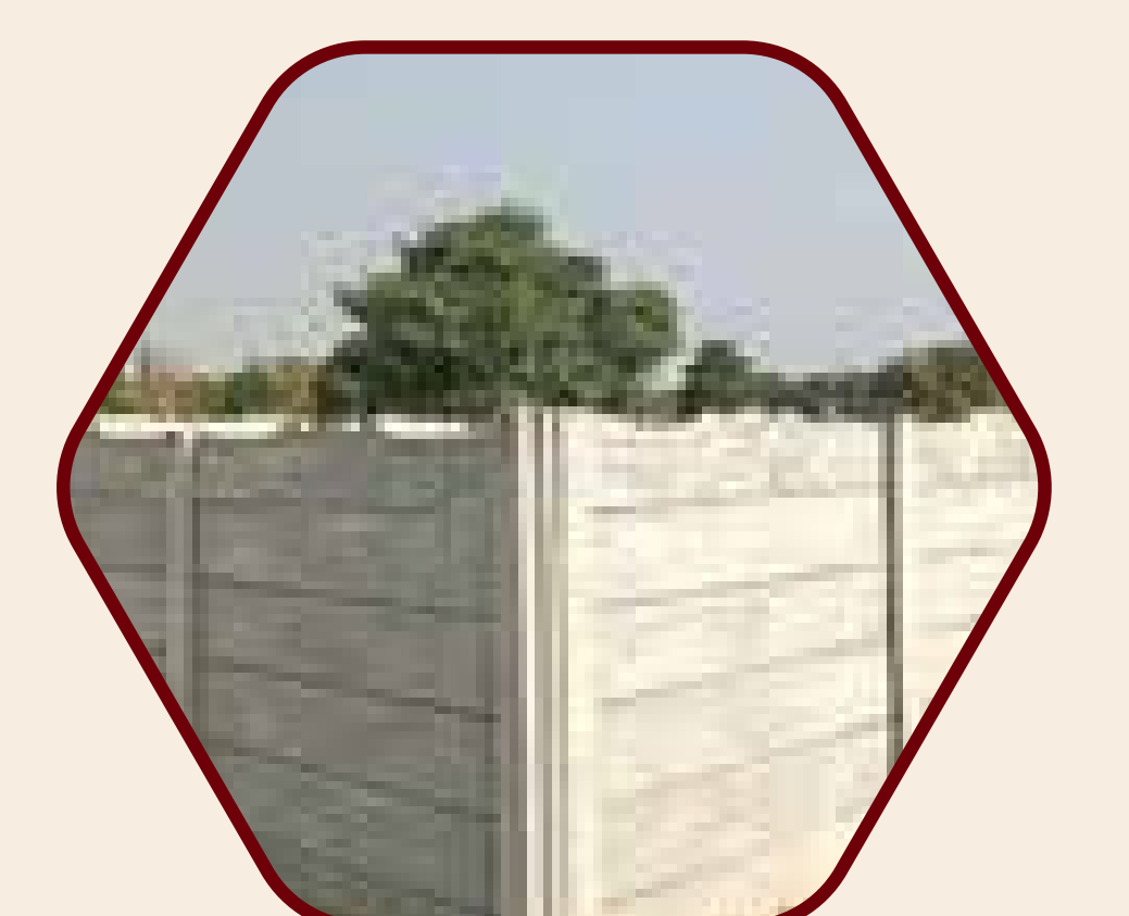
Fully Compound Wall