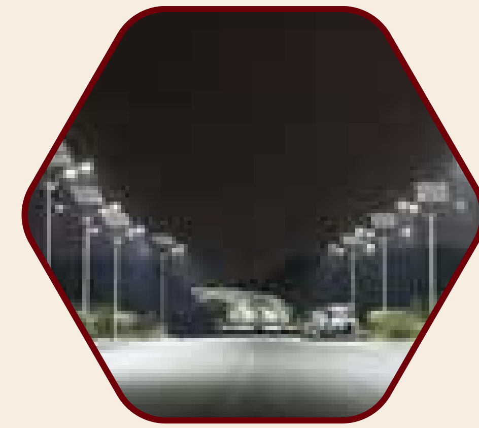
Solar Street Lights