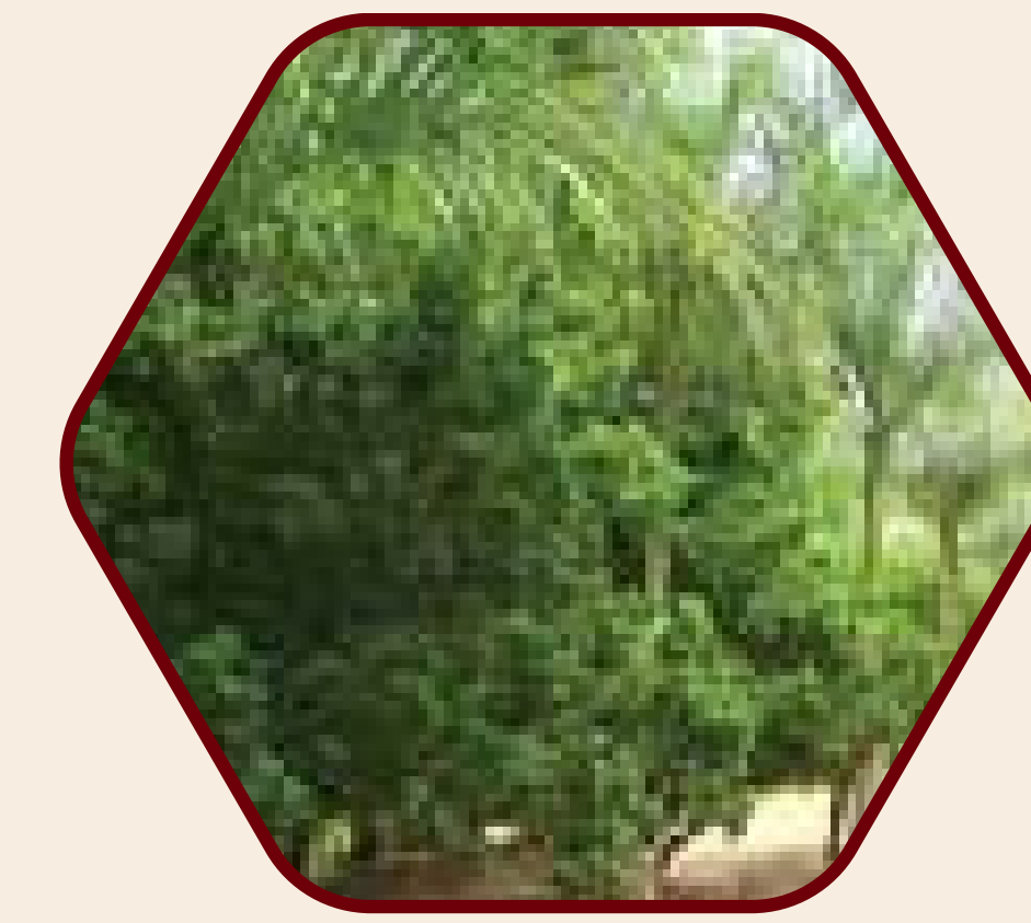
Avenue Tree Plantation